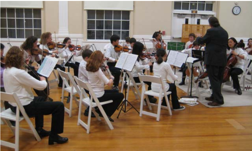
Multi-generational Orchestra at SSN

The Suzuki program concentrates on cognitive, social and psycho-motor development. These are interwoven throughout the program to fully develop each child's abilities and interests prior to his or her introduction to a primary school setting. The essential goal is to instill in each child a love of learning that lasts a lifetime.